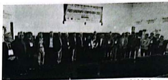
Figure 1. First Graduate Conference 2023 closing

The Directorate of Research and Extension (DoREX) took the initiative to host the First Graduate Conference 2023 at Agriculture and Forestry University (AFU). The conference centered around the theme of "Agricultural Transformation through Education and Research," highlighting the crucial role of academic endeavors in advancing the agricultural sector. From November 23rd to 25th, young researchers gathered to share insights and discoveries across various fields, including agriculture, livestock science, veterinary science, fisheries, and forestry. With a diverse array of topics covered, the conference facilitated interdisciplinary collaboration and knowledge exchange, fostering a dynamic environment for intellectual growth and innovation. Over the course of the event, more than 100 papers were presented, showcasing the breadth and depth of research undertaken by emerging scholars in the field. DoREX's commitment to organizing such a significant academic gathering underscores its dedication to supporting the next generation of agricultural leaders and promoting sustainable solutions for global food security and environmental conservation.