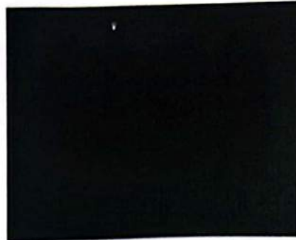
Figure 1. Insert your caption here.

The following format is for the body of the text and is specifically for the Agriculture science centers, constituent colleges, private colleges and veterinary teaching hospital of AFU. Your content will look exactly similar in the final format as you are viewing this document. The text should be in Times New Roman font, size 12, and justified. This portion should be the focal activity of your institution, completed or ongoing and should be concise and well-written. The bulletin is meant to be concise, so you are allotted half a page to showcase your activities (exactly the same space as shown in this format). Include one image (mandatory) related to the activity with an appropriate caption. The caption should be in Times New Roman with size 10, italicized, and in Sentence case . Please also upload the inserted image separately in .png format so that we could process high quality image of your activity in the final format. If you encounter any confusion related to the format, or have any questions, please feel free to contact us at publication@afu.edu.np or at +9779846224000. A model of the format for the institutions listed above is provided below. You can use it as a reference.