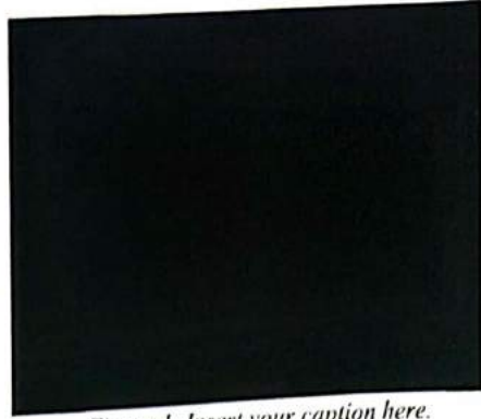
Figure 1. Insert your caption here.

The following format is for the body of the text and is specifically for the Central office, Office of the controller of examinations, directorates, and centers of AFU. Your content will look exactly similar in the final format as you are viewing this document. The text should be in Times New Roman font, size 12, and justified. This section should serve as the focal point of your institution's activities, providing information on completed or ongoing initiatives, as well as administrative matters. The bulletin is meant to be concise, so you are allotted a page to showcase your activities (exactly the same space as shown in this format). The text could be divided into several paragraphs.