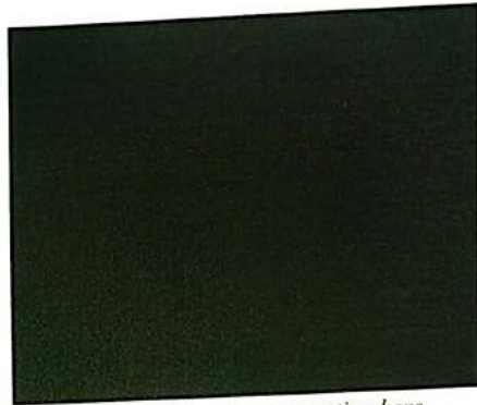
Figure 2. Insert your caption here.

The following text is just the repetition of the above text to show how your final contents will be in the final document. The following format is for the body of the text and is specifically for the Central office, Office of the controller of examinations, directorates, and centers of AFU. Your content will look exactly similar in the final format as you are viewing this document. The text should be in Times New Roman font, size 12, and justified. This section should serve as the focal point of your institution's activities, providing information on completed or ongoing initiatives, as well as administrative matters. The bulletin is meant to be concise, so you are allotted a page to showcase your activities (exactly the same space as shown in this format). Include two images (mandatory) related to the activities with appropriate captions. The captions should be in Times New Roman with size 10, italicized, and in Sentence case . Please also upload the inserted image separately in .png format so that we could process high quality images of your activities in the final format. If you encounter any confusion related to the format, or have any questions, please feel free to contact us at publication@afu.edu.np or at +9779846224000. A model of the format for the institutions listed above is provided below. You can use it as a reference.