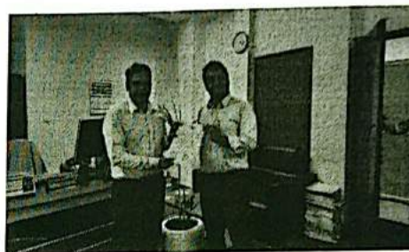
Figure 2. MoU signing between DoREX and AFU faculty

DoREX has achieved significant milestones in advancing agricultural research and outreach. DoREX has selected 14 internally funded short-term research projects and 11 long-term research projects for the faculties of AFU, promoting interdisciplinary collaboration and addressing key agricultural challenges. Through strategic partnerships with various institutions, including universities, local governments, NGOs, and INGOs, DoREX is leveraging expertise and resources to tackle pressing issues in the sector.